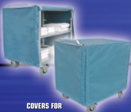
COVERS FOR PUSH OR SMALL CARTS

SUPERIOR MATERIAL TOUGH QUALITY CRAFTSMANSHIP