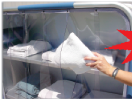
TRANSPARENT PASS-THROUGH FRONT COVER