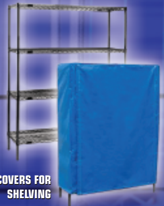
COVERS FOR SHELVING