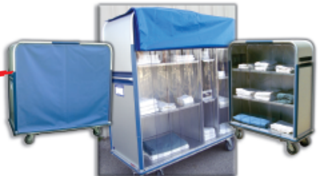
DOUBLE COVER SYSTEM : COMBINATION OF 16 OZ. VINYL COVER AND TRANSPARENT PASS - THROUGH SYSTEM