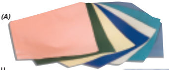
Choice of Colors (A)

Zipper (D) or Velcro Closures: Please choose one