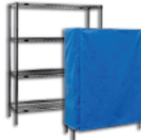
Square Style Drape Cover: ideal for all types of supply carts or shelving