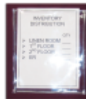
Transparent Routing Inventory Pocket (J)