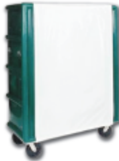
Sample of other brand of cart with front cover.

MATERIAL COLOR CHOICES: Mauve, Tan, Dark Blue, Grey, Teal and Slate Blue.