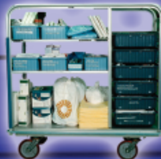
COVERS FOR CENTRAL SUPPLY CARTS