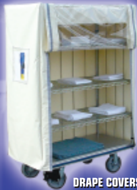
DRAPE COVERS ALL TYPES OF CARTS & EQUIPMENT