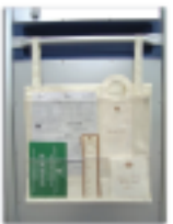
External Pocket for Paperwork or Form Organizer (H)