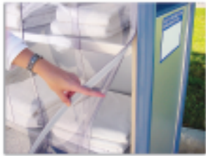
Transparent Pass Through (C)

Handle Cut Outs (F) per your specifications, please make comments below and on the provided measurement guide. _____