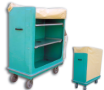
Round Tripper Cart (B)

Toll Free 800-826-1245 • Local & Int'l Ph: 830-401-4400 Fax: 830-401-0600 • www.tqind.com • Email: sales@tqind.com