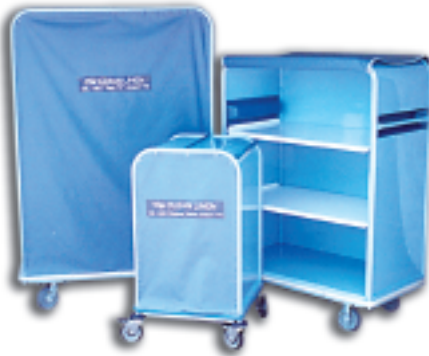
TECNI-QUIP Carts with Front Covers

You may convert Zipper Covers to Velcro or Vice Versa or You may Convert any cover to the "new" Pass-through Front cover system