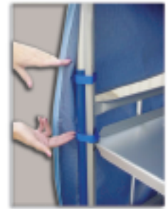
Velcro Ties: Secure cover to cart