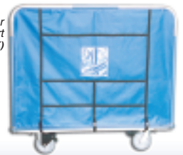
Webbing for Over the Road Transport (K)