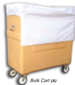
Bulk Cart (A)

Two (2) Styles of covers offered, your choice of either Full Drape Style or Cut out Cap Style. Both will cover cart and protect linens or supplies. Variety of colors and materials, see measurement guide for details and contact us.