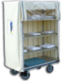
Transparent Front Panel Shown with Drape Cover (B)