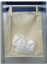
External Pocket for Soiled Linen Collection (G)