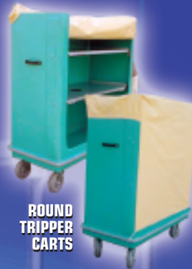
ROUND TRIPPER CARTS