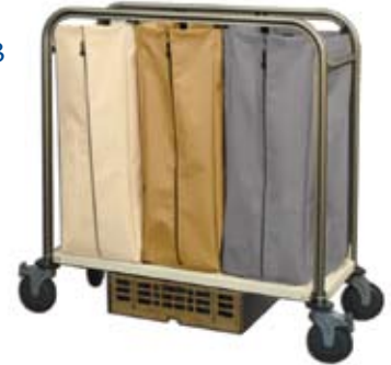
shown with optional glass rack