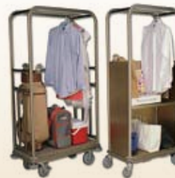
LUGGAGE AND "NEW" SHOPPING PACKAGES CARTS