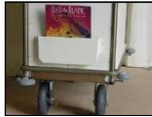
Literature rack, may be customized.