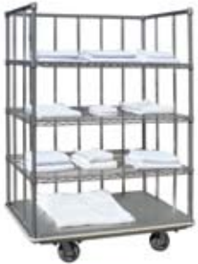
HB-100-R LINEN TRANSPORT