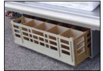
Lower storage area or glass rack holder.