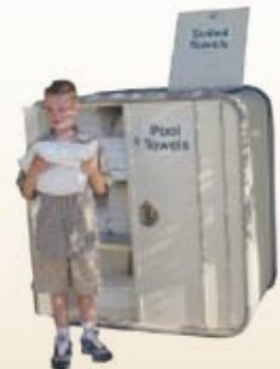
POOL TOWELS CLEAN DISPENSED & SOILED COLLECTED