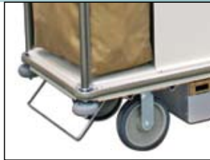
Stainless steel vacuum rack, 4 rolling corner bumpers & full perimeter bumper.