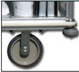
Large non-marking wheels designed to roll on carpet easily. Other tread for outdoor or tile available.