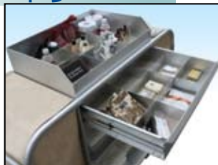
Pull out drawers with movable organizational dividers. Shown here with standard upper staging area.