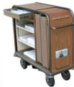
WOOD GRAIN—FURNITURE LOOKING CARTS ALL MODELS