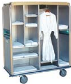
L-77 ORGANIZE & PROTECT LINEN DELIVERY