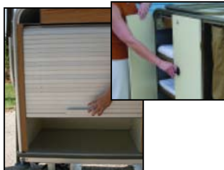
Security doors, roll-up tambor or front panels, lockable.