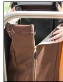
Ergonomic EZ to unload soiled collection bags.

The modular configuration of these models allow for design flexibility and creativity. Your representative and the TQ staff will help you design the "perfect cart"! Consult our in-house experts today!