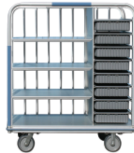
Supply Transport Many Sizes & Models MedX-Series