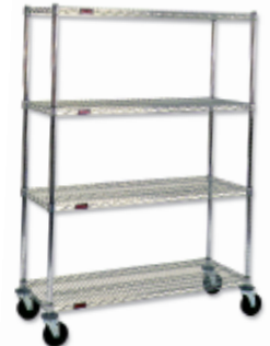
Mobile Shelving HA-Series