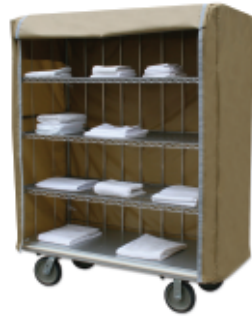
Cart Covers Any Size Variety of Colors