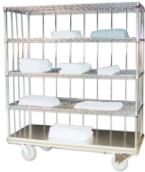
Linen Carts With Solid Base HB-Series