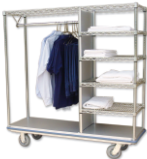
Clothing Transport HHT-Series