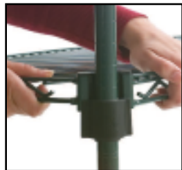
QUAD ADJUST CLIPS allow easy relocating of shelves without disassembling entire unit.