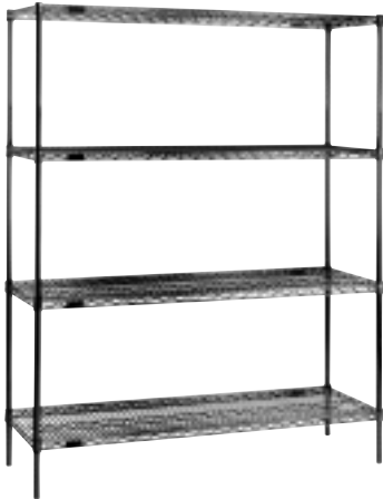
Quad-Adjust Shelving with 4 shelves

EAGLE BRIGHT FINISH: NSF Finish for dry storage, Bright Zinc plated and Sealed. Kit Consists of: 2 Quad Adjust Wire Shelves & Four Posts 74" Additional shelves may be purchased see page