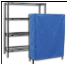
Vinyl or Poly covers available - Call or see price list.