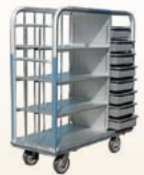
MEDX-SERIES SUPPLY CARTS OPEN AND ENCLOSED MODELS