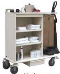
CS-2 HOUSEKEEPING & LINENS