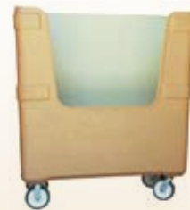
TQ-1200 BULK CARTS FOR COLLECTION OR TRANSPORT (ERGONOMIC SPRING BOTTOM)