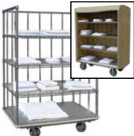
HB-100-R LINEN TRANSPORT COVERS AVAILABLE

Tecni-Quip carts save money and boost productivity. Here are a few of our most popular models ... all manufactured by TQ in the U.S.A. just for you!