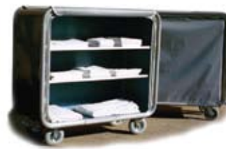
OUTDOOR OR TOWING WATERPROOF