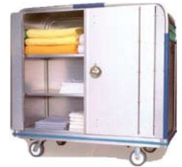
L-767 SECURITY LINENS, SCRUBS, SUPPLIES