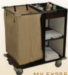
MY EXPRESS LOBBY, HOUSEKEEPING OR JANITORIAL