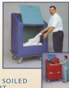
TQ-236 WASTE & BIO- HAZARDOUS COLLECTION CARTS