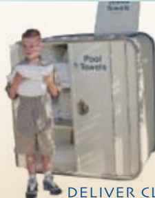
PT-SERIES DELIVER CLEAN & COLLECT SOILED TOWELS IN SAME CART POOL/ P.T./ WELLNESS CENTERS