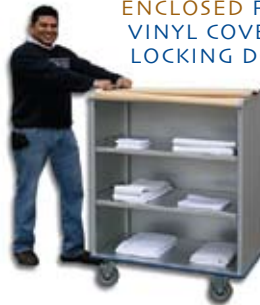
SPD-900 SMALL ENCLOSED FRONT VINYL COVER OR LOCKING DOORS