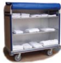
L-66 ENCLOSED CARTS ORGANIZE & PROTECT LINEN DELIVERY